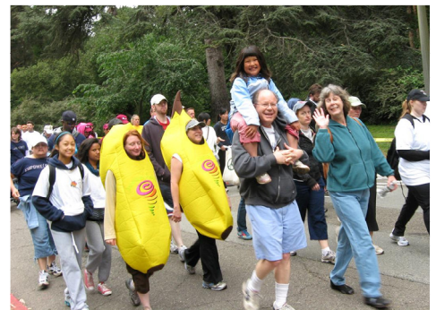
First United's Team 2008 in action!