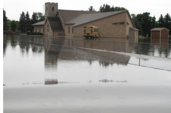
Peace Lutheran Church, Burlington, ND

Last evening and this morning I worshipped in 3 of our 4 current locations in Minot. I saw lots of tears, heard awesome sermons and had a chance to talk with evacuees and host families. I heard one pastor, who currently has 2 feet of water on the main floor of his house, talk about taking a break yesterday and getting a huge hug from his 4 year old granddaughter. He talked of how that is what all of us need to