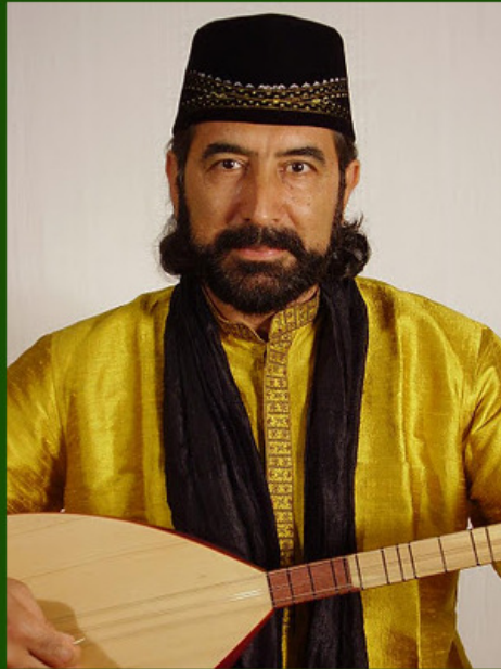
Latif Bolat: One of the most well-known Turkish musicians in the U.S.

Turkish Folk Music, Sufi Mystic Stories & Images from Ancient Turkey: An Evening with Latif Bolat